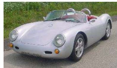
Shown in Silver

Special Edition, Inc. 1347 West North Street Bremen, Indiana 46506 (574) 546-4656 - Shop www.BeckSpeedster.com