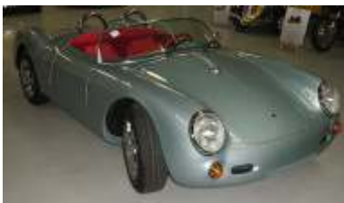
Shown in Sliverblue