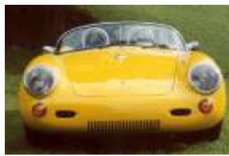
Shown in Custom Sunburst Yellow